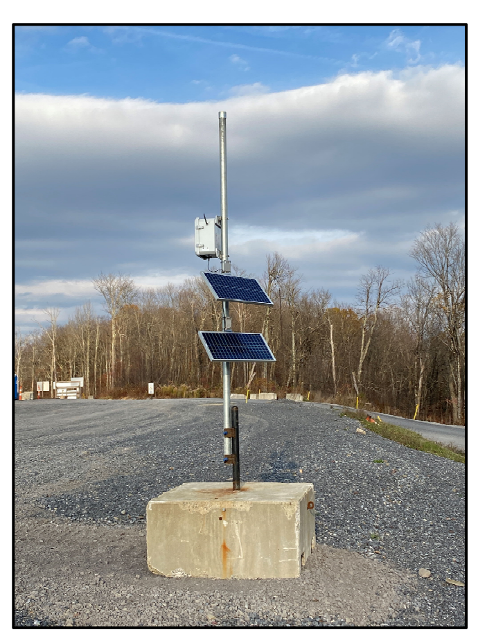
Canary X CH4 monitoring device