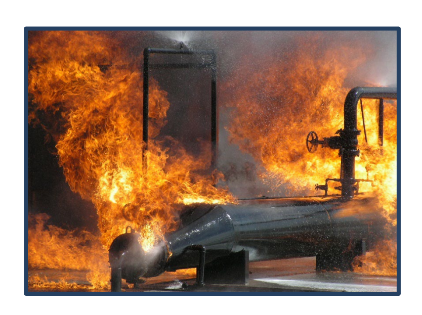
From: injuries, deaths, and violations...